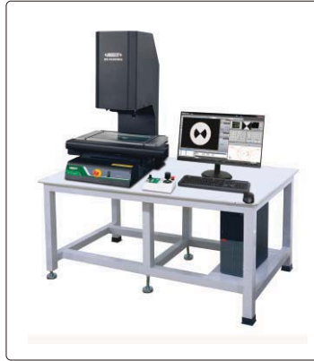
desk ( optional )