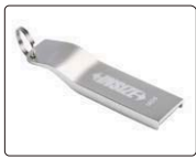
software flash disk (included)