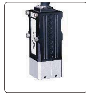
laser probe ( optional ) measuring accuracy is 5µm