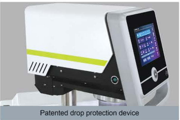
Patented drop protection device