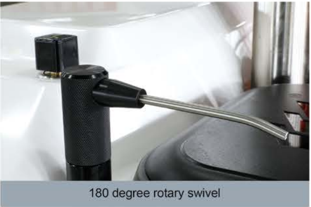
180 degree rotary swivel

Safe and reliable It conforms to EU safety standards