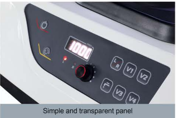
Simple and transparent panel