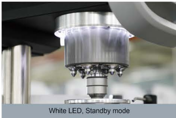
White LED, Standby mode