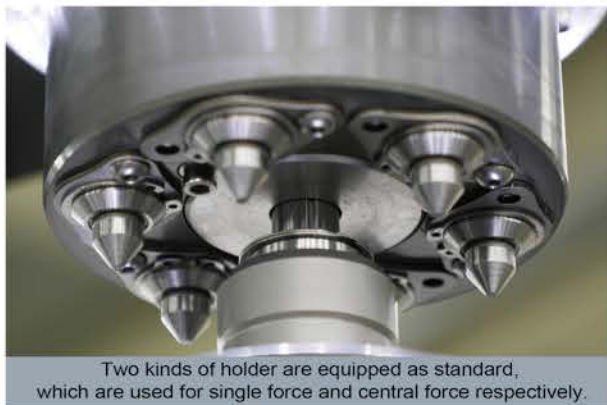
Two kinds of holder are equipped as standard, which are used for single force and central force respectively.

Stable and durable Lifting and self-locking patent design eliminates the cumbersome manual lock and eliminates safety hazards At least 3000 sets of data storage