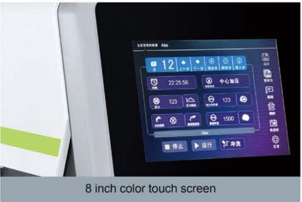
8 inch color touch screen