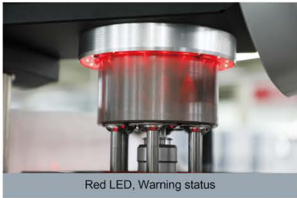
Red LED, Warning status