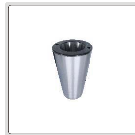
BT50/BT40 converter (optional)