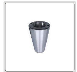
BT50/BT30 converter (optional)