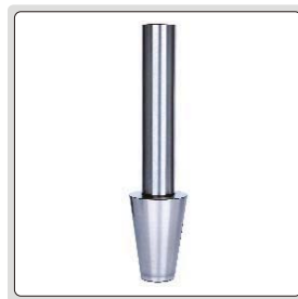
standard rod (included)